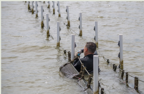
Oyster farming.

Oyster health and growth rate can be influenced by water temperature, dissolved oxygen, salinity, daily air exposure time, and wave action. However, no affordable, open-source sensor is ideally suited to capture this suite of data, especially from within an oyster aquaculture bag.